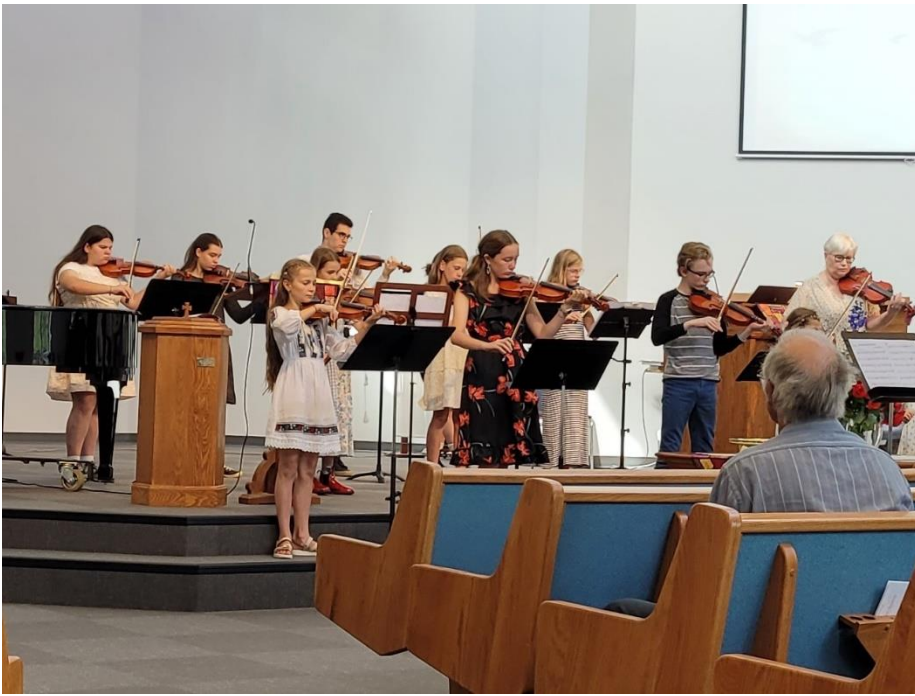
Blaak Art Students at June 11, 2023 Service